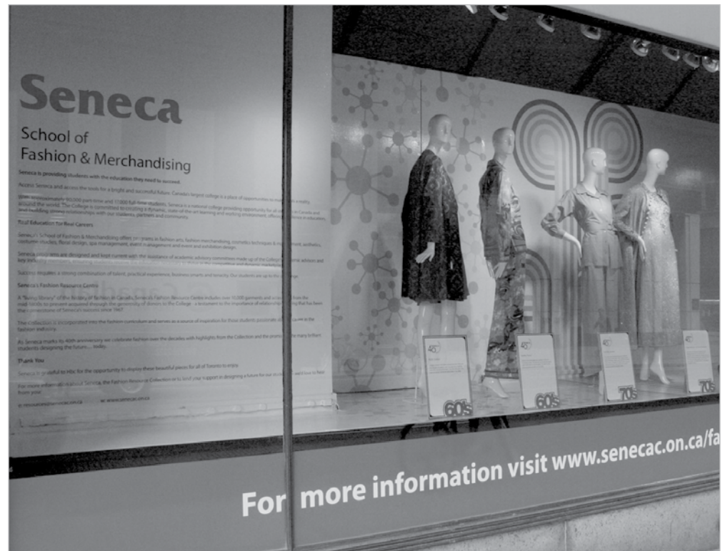
Celebrating fashion over the decades: Hbc helps Seneca mark four decades of fashion by displaying pieces from Seneca's Fashion Resource Centre

Thank you, Hbc for opening your doors, rather, your windows, to showcase Seneca and the many brilliant students designing the future...today.