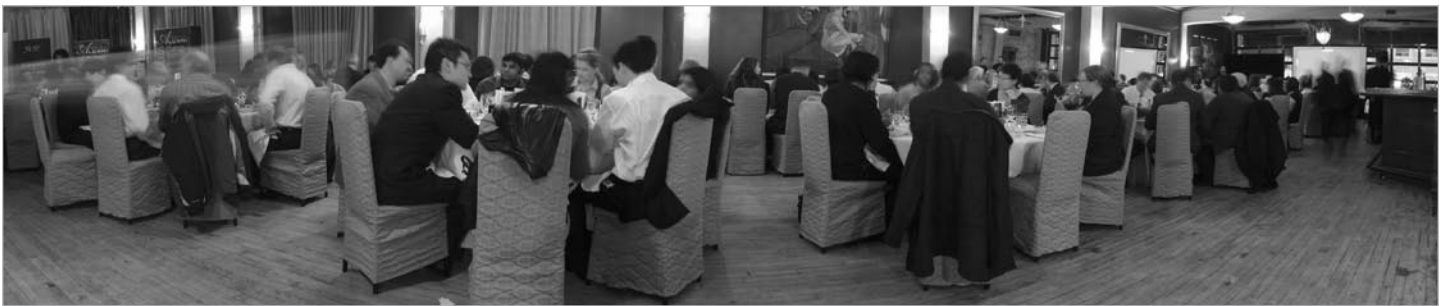
School of Accounting and Finance Reunion held at the Acrobat Lounge on February 7, 2008.

For information about organizing a class reunion for your school or program, contact Seneca Alumni at 416.491.5050 x2960, or alumni@senecac.on.ca